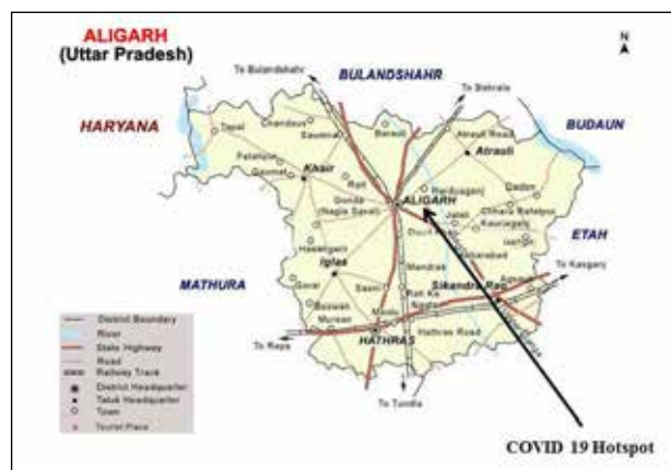
Figure 1: The most hotspot area of Aligarh City

600 samples a day. The Medical College continues to conduct free-of-cost coronavirus tests and so far 596 cases (22 June 2020) have been found positive out of 22346 samples that referred from Aligarh and nearby cities like Mathura, Noida, Agra, Hathras, Bulandshahr, Moradabad, Rampur, Kasganj and Etah. The figure 1 shows the most hotspot area of Aligarh City.