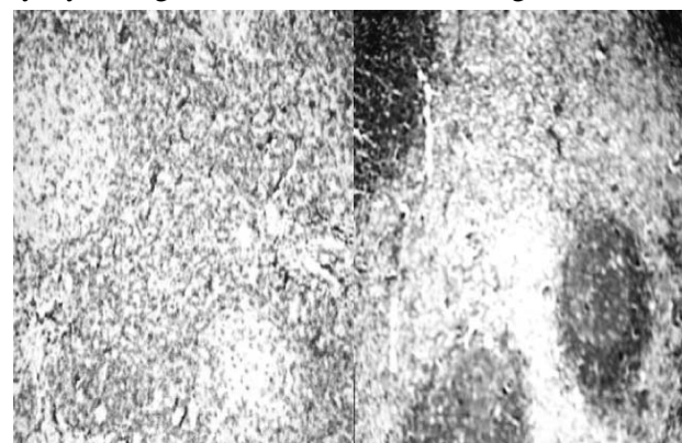
Figure III: Photomicrograph showing normal T cell and B cell staining positive with CD3 & CD20 respectively. [IHC, X100]

A variant of lymphadenitis mimicking interfollicular Hodgkin's lymphoma, characterized morphologically by changes in the interfollicular region within a