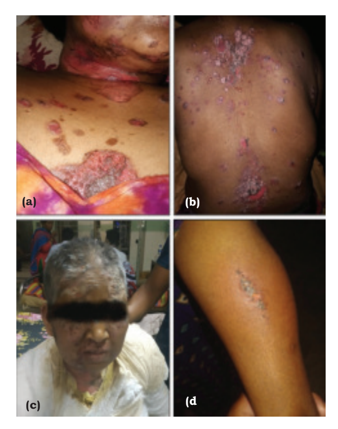
Fig.-1: Multiple blisters spreading all over the body. Multiple painful red lesions on a) neck and upper part of the chest b) back, c) face and salp, and d) leg

Her initial laboratory investigations were taken and revealed hemoglobin of 11.2gm/dl, white blood cell and platelet count were 26X 10^3/cumm and 565000/cumm respectively. Differential count showed Neutrophil 55%,Lymphocyte 30%, and Eosinophil 10%. She had normal hepatic and renal function as her alanine aminotransferase, aspertate amino transferase, and creatinine were 18U/L, 22 U/L, and 0.5 mg/dL respectively. Her anti nuclear antibody was negative and serum albumin level was 32g/dl. Her serum electrolyte showed mild hyponatraemia with