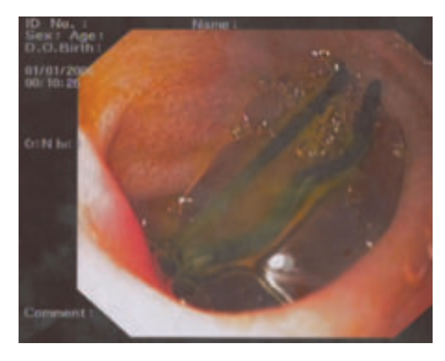
Fig.-2: Foreign body stucked in 2nd part of duodenum