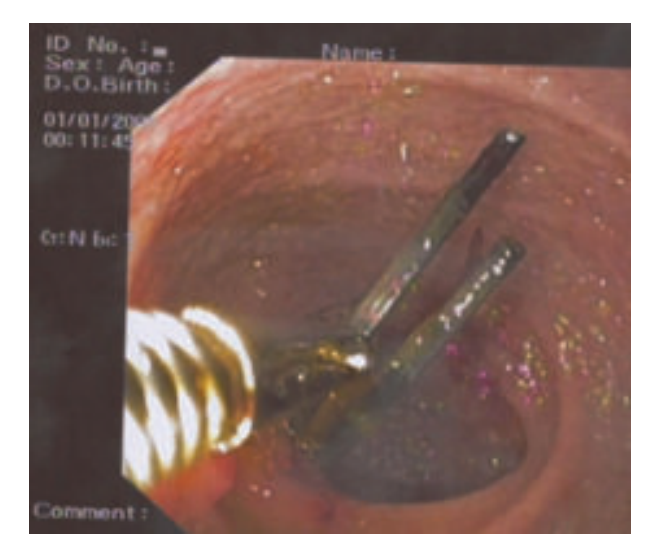
Fig.-3: Foreign body with one sharp end hold by alligator forcep