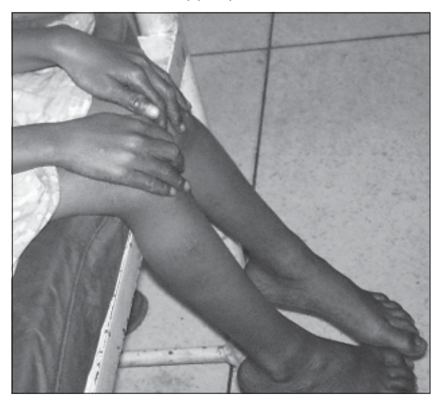
Fig.-2. Showing pigmentation over the exposed part on both the extremities.