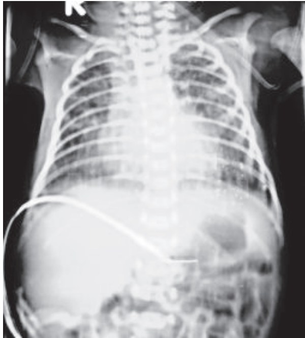
Fig.-2: Bilateral diffuse alveolar infiltration in an enrolled preterm newborn presenting early onset pneumonia

Most common radiologic change was localized/diffuse alveolar infiltrates in more than half 58% (55/94) of the newborn with pneumonia. Other findings were uni and or bilateral haziness and sublobar, lobar consolidation in 23% (22/94) and 18% (17/94) and respectively (Figure 2 and 3).