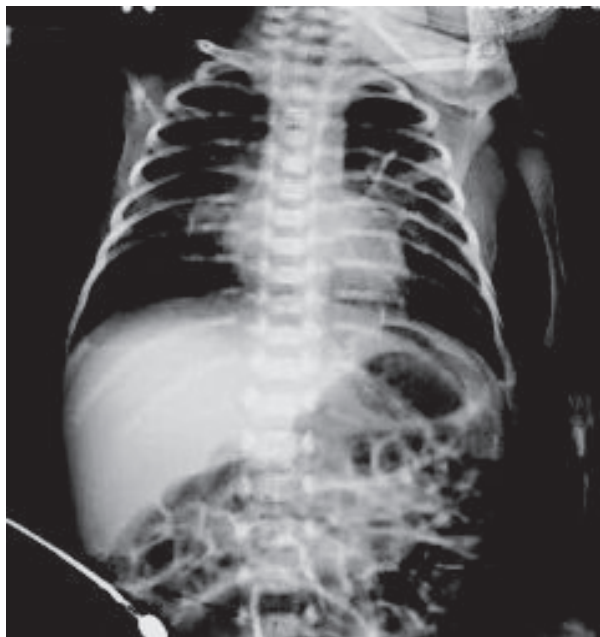
Fig.-3: Inhomogenous opacity in an enrolled preterm newborn presenting early onset pneumonia

Mean duration of hospital stay was 13 \pm 8 and 19 \pm 8 days. Majority 76.5% (72/94) of the neonatal pneumonia were cured while 5% (5/94) left against medical advice and 18% (17/94) died during their hospital course (Figure 2).