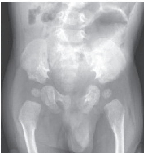
Fig.-4: X-ray pelvis showing small, square iliac crest with spikes of bone at the triradiate cartilage.

X-ray hand showed 6 th metacarpal and phalanx on the ulnar border of the both hands (Fig.-5). X-ray lower limbs showed tibial segments were disproportionately shorter than the femoral segments with expanded and abnormally shaped metaphysis of long bones (Fig.-6). Perimembranous VSD with single atrium was found on color Doppler echocardiography.