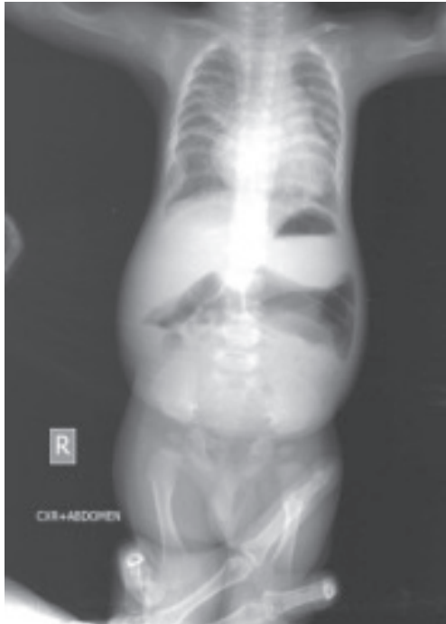
Fig.-3: X-ray chest including abdomen showing narrow thorax, patchy opacities in both lung fields with mild cardiomegaly.

Laboratory investigations revealed neutrophilic leukocytosis with microcytic hypochromic anemia. On chest X ray there was patchy opacities over both lung field and cardiomegaly with narrow chest and short ribs (Fig.-3). X-ray pelvis showed small, square iliac crest, spikes of bone at the triradiate cartilage (Fig.-4).