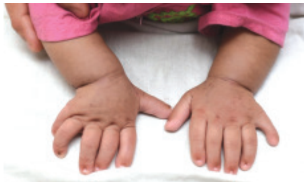
Fig.-2: Bilateral post axial polydactyly with dystrophic nails.