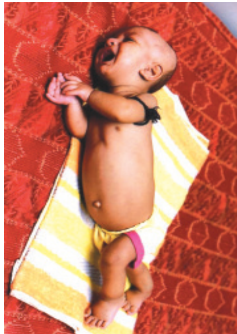
Fig.-1: Short, broad hands and feet, narrow thorax.

The patient had multiple skeletal anomalies including short broad hands and feet with distal shortening of both upper and lower limbs, post axial polydactyly in both hands (with 6 digit each), dystrophic nails in both hands and feet (Fig.-1,2). The patient also had narrow thorax (Fig.-1), high arched palate and the sulcus between upper lip and gum was obliterated.