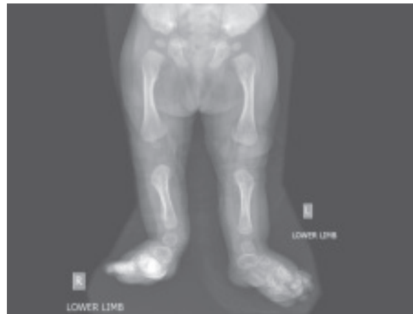
Fig.-6: X-ray lower limbs showing tibial segments are disproportionately shorter than the femoral segments with expanded and abnormally shaped metaphysis of long bones.

Based on clinical features, skeletal survey and echocardiography reports we came to a diagnosis of Ellis-van Creveld Syndrome with bronchopneumonia. Child was treated for pneumonia. After improvement the baby was referred to paediatric cardiologist for management of congenital heart disease.