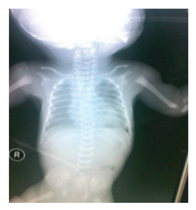
Fig.-1:CXR of Congenital Acinar Dysplasia

The infant was intubated for progressive hypoxemic respiratory failure and responded to one dose of surfactant, leadingto extubation within 24 hours. The respiratory status deteriorated within 48 hours with CXR (Fig.1) demonstrating bilateral opacities leading to reintubationand mechanical ventilation with additional surfactant administration with partial and