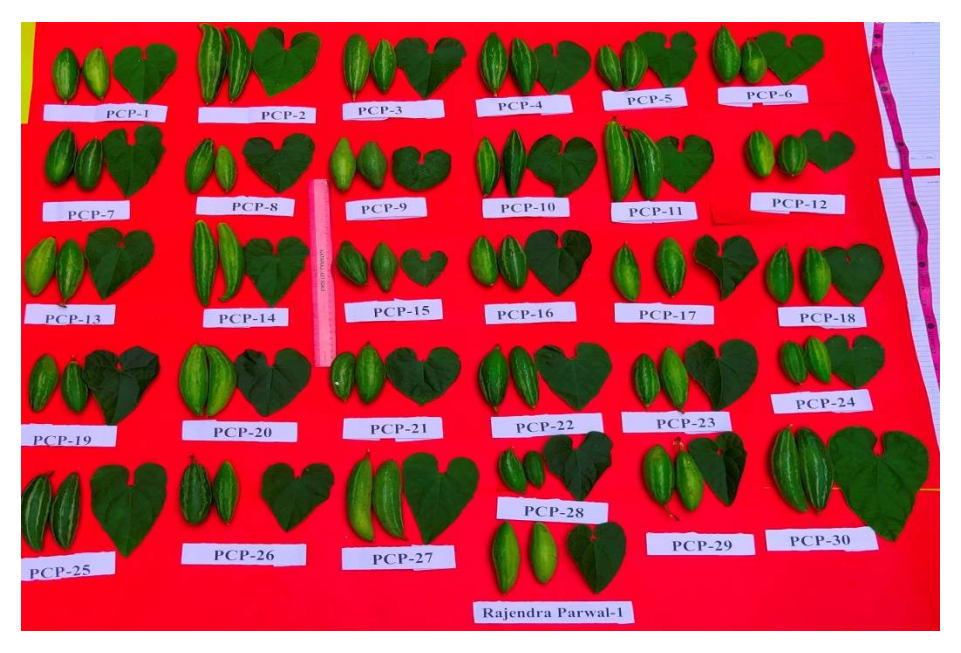
Fig. 1. Variation in fruit and leaf appearance for 31 genotypes of pointed gourd

The D<sup>2</sup>value was estimated for thirty one(31) pointed gourd genotypes and total eight numbers of clusters were formed (Table 2). Cluster I had the highest number of genotypes (13), followed by cluster II (6 genotypes), cluster III (5 genotypes) and cluster IV (3 genotypes). The remaining four (4) genotypes were equally distributed among the remaining four clusters. Verma et al. (2017) in an experiment on pointed gourd categorized into seven clusters as per the D<sup>2</sup>value of thirty nine genotypes of pointed gourd. The present study indicated that the locational distribution of different genotypes were not related to genetic variation as the genotypes collected from same location were grouped into different distinct cluster.