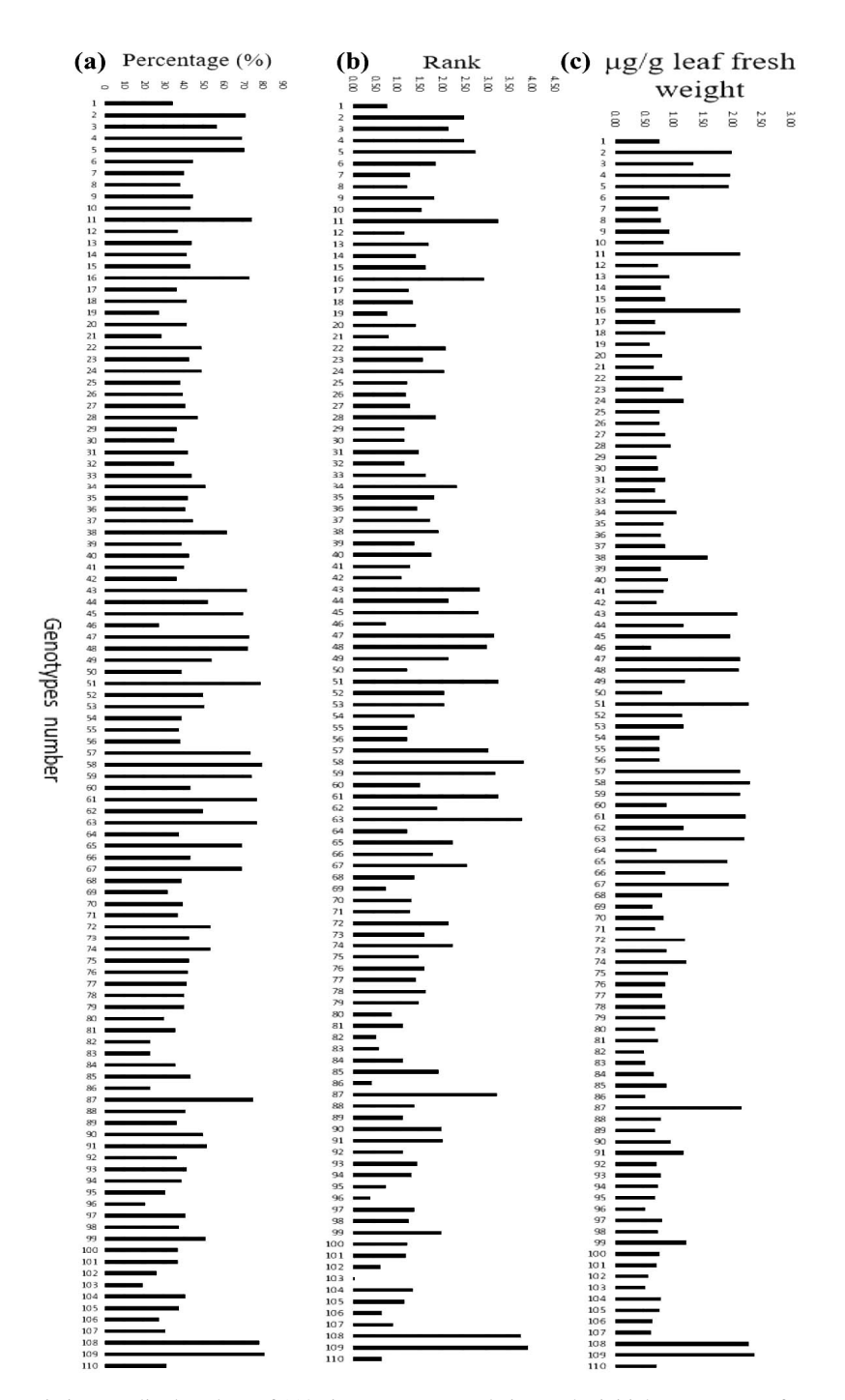
Fig. 2. The variation amplitude values of 110 citrus genotypes relative to the initial temperature of stress (3° C) for the three traits of cell degradation index. (a) Electrolyte leakage, (b) Leaf water soaking, and (c) Malondialdehyde concentration.