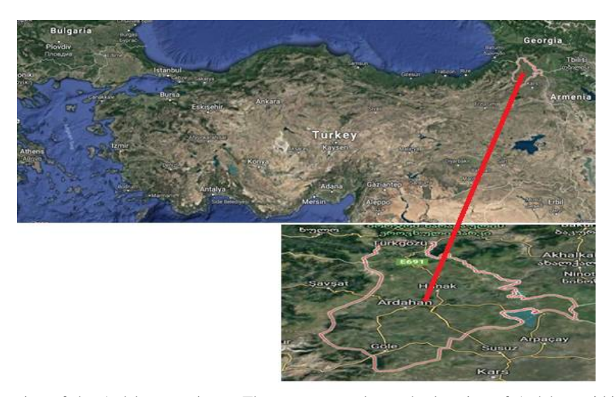
Fig. 2. Location of the Ardahan province. The upper map shows the location of Ardahan within Turkey while the enlarged region of Ardahan is shown in the lower map. The maps were obtained from Google Maps (maps.google.com).

Apple genotypes used in the study were collected from certain regions in Ardahan/Turkey between July and August, 2015 (Fig. 2). Total genomic DNA samples were extracted using DNA Plant Kit (Gene Mark). The genomic DNA samples were stored at -20 °C.