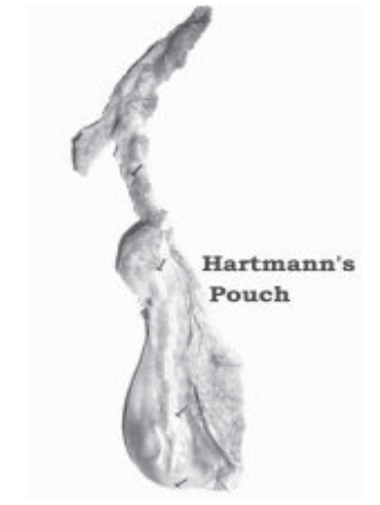
Fig.-1: Showing Hartmann's pouch of gallbladder

result of plain enlargement or due to adherence to the cystic duct or bile duct<sup>5</sup>. When a gallstone lodges in this area, the gallbladder cannot empty normally and contractions of the gallbladder wall produce severe pain<sup>6</sup> and leads to mucocele of gallbladder. So its identification is useful in delineating biliary anatomy while performing a cholecystectomy.