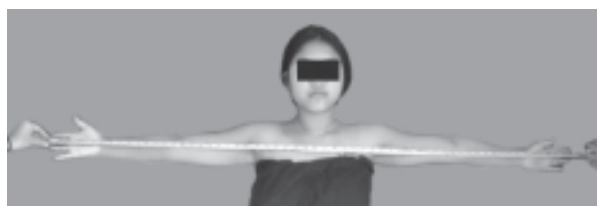
Fig.-1 Procedure of measuring the arm span

the elbows and wrists extended and the palms facing directly forward (Figure 1). Readings were taken to the nearest 0.1 centimetres. Each subject was measured twice. When the two measurements for each parameter agreed within 0.4 centimetres, their average was taken as the best estimate for the true value. When the two initial measures did not satisfy the 0.4 centimetres criterion, two additional determinations were made and the mean of the closest records was used as the best estimate. 1