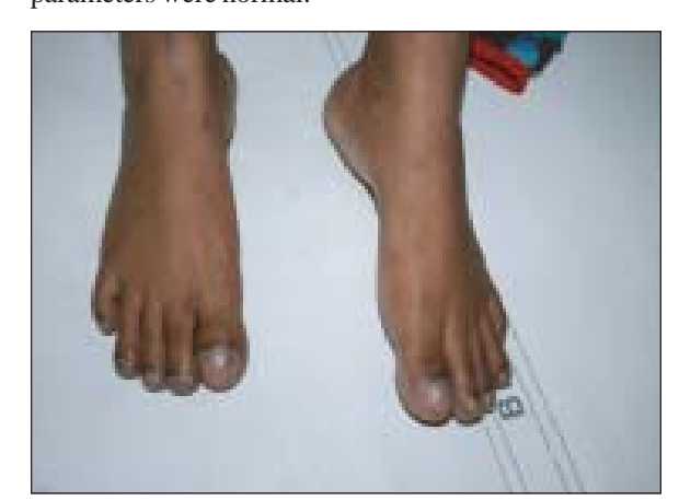
Fig 1(a): Clubbing

to conception. She was married for 8 years having history of two consecutive intra uterine fetal death (IUFD). First IUFD was at 32 weeks at 2007 and second one was at 34 weeks at 2008. Both were delivered vaginally. She said that she developed peripheral cyanosis in her previous pregnancies but she did not consult with any physicians. She was a home maker and came from a poor family. At the time of admission, she was not anaemic. There was no oedema. There was cyanosis and clubbing [Fig 2 and Fig 3]. Her vital parameters were normal.