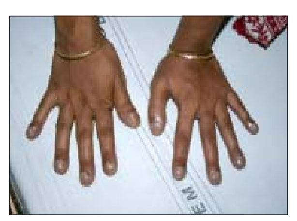
Fig 1(b):- Clubbing

Received: 12 August 2013 Acceptance: 22 December, 2014