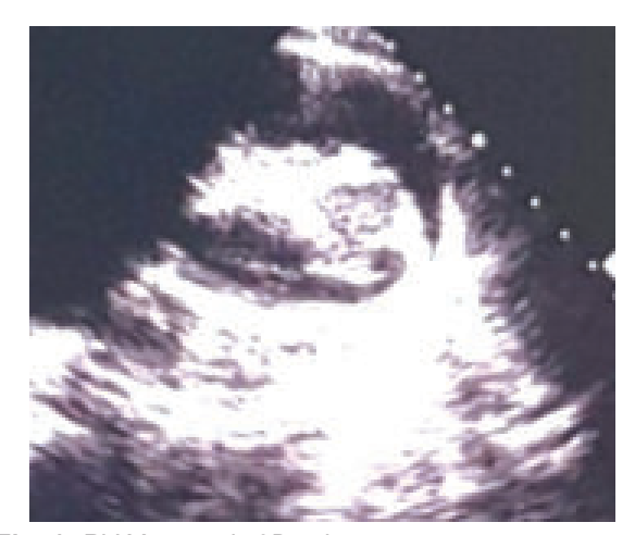
Fig.-1: RV Myxoma in 2D echo