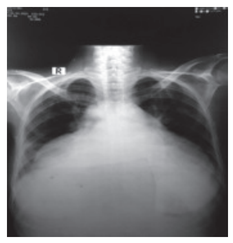
Fig-3: X-Ray chest P/A view: Features of pericardial effusion.