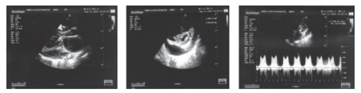
Fig-4: Echocardiography (2D,M-Mode and Doppler): Severe MS(MVA-0.59cm<sup>2</sup>), subvalvular changes and pericardial effusion .