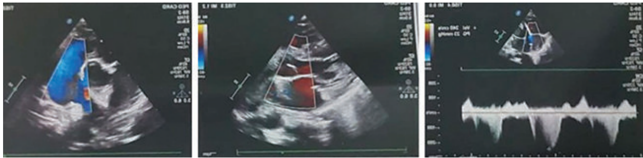
Figure 3: Postoperative Echo after 6 month follow up.