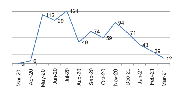
Fig.-2: Bar diagram showing month wise distribution of COVID-19 patients (n=769)

It was noted that the infection rate was highest in the month of July during the early stage of the pandemic in Bangladesh. Subsequently, the infection rate plateaued in our hospital (Figure 2).