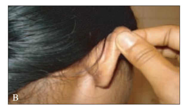
Fig-1(Group-I case): (A) Keloid on the posterior surface of the right earlobe. (B) In the post treatment two years, no residual in earlobe.