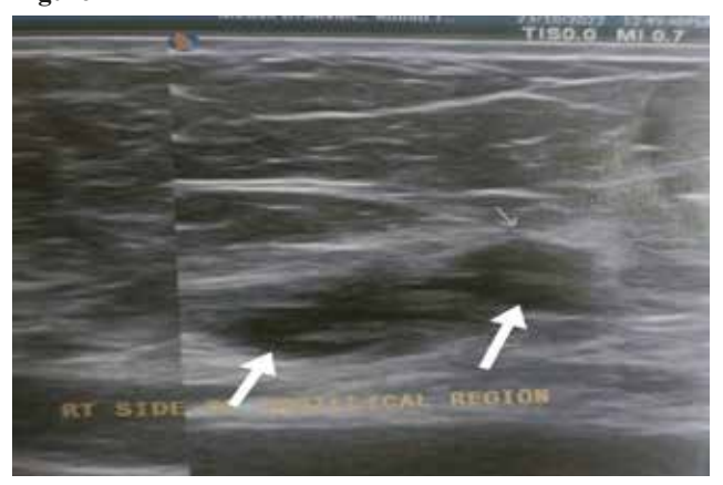
Figure-3 : Abdominal ultrasound showing mixed echogenic focal area in the deeper part of subcutaneous layer; extended to right lower rectus sheet

When she came to my clinic I examined her and found a diffuse mass like feeling below the umbilicus. Considering her history, examination and previous scan findings ectopic endometrioma was suspected and confirmed by repeat ultrasound.