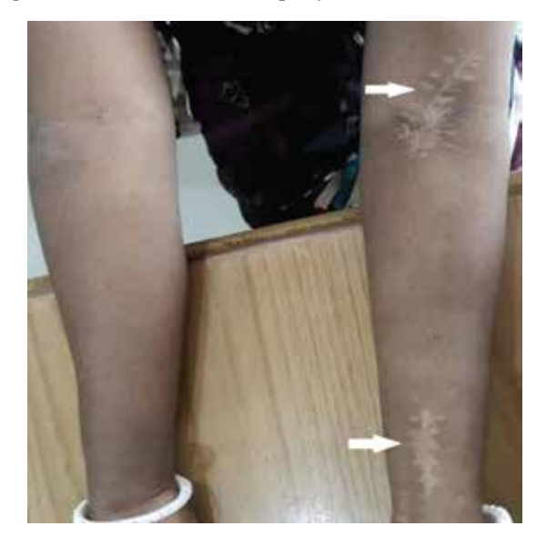
Figure 2: Embolectomy scar in left upper limb.