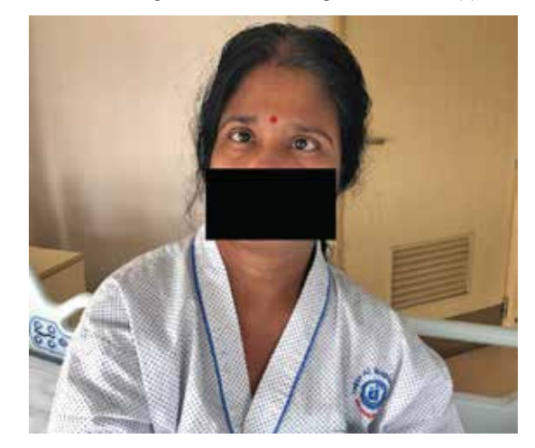
Figure 1: B/L 6<sup>th</sup> cranial nerve palsy