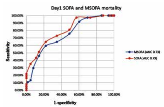
Figure-1: Receiver operating characteristics curve for day 1 SOFA and mSOFA score and prediction of mortality

Using the ROC curve, we found that the day 1 SOFA score predicted mortality better than the day 1 mSOFA score with an AUC of 0.79 (95% CI, 0.70-0.88) and 0.73 (95% CI, 0.64-0.83) respectively (Figure 1). While, day 3 SOFA and mSOFA scores performed equally well in predicting the mortality with AUC of 0.91 (95% CI, 0.85-0.96) and 0.92 (95% CI, 0.88-0.97) respectively (Figure 2).