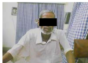
Fig 1: The Patient

outlined hypo echoic lesion, about 6 cm in diameter, located in the extreme superior aspect of the lateral aspect of right lobe (Fig-2). The liver was however not enlarged. Chest skiagram revealed mild degree of right sided pleural effusion.