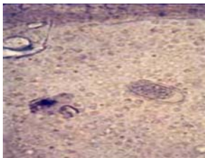
Fig 3: Fertilized ova

material was obtained. Upon direct examination, fertilized eggs and larvae of Ascaris lumbricoides were found (Fig. 3,4). Gram stained smears revealed scarce Gram-positive cocci with intense neutrophilic reaction. Culture and sensitivity of the aspirated fluid yielded growth of Staphylococcus aureus . Mebendazole as well as a Cephalosporin preparation was prescribed and the patient became reasonably well. Check Ultrasonogram after 6 wks. Revealed a heterogeneous alteration (suggesting a healing lesion) but no mass or liquid collection was seen.