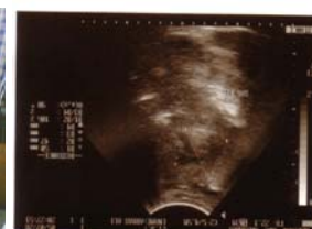
Fig 2: Ultrasonograph of Liver

Upon admittance he had fibrile peaks of upto 100 0 F. With tachycardia. He appeared severely anaemic, no visceral enlargement was found but tenderness was detected in right hypochondriac region of abdomen.