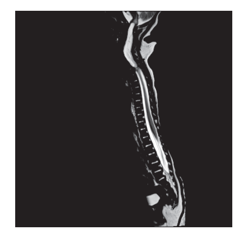
Figure B : T2W sagittal image showing a hyperintense lesion. But the mass lesion is less intense compared to T1W image.

reported. They typically occur in children and have a predilection for the cervical and thoracic spinal cord.<sup>2</sup> Intramedullary spinal cord tumor can be focal or may involve the entire spinal cord from the cervicomedullary junction to the conus. These tumor have a solid component and often are associated with a rostral and caudal cystic component.<sup>6</sup> Patient with intramedulary spinal cord lipoma present with significant neurological compromise and have a very poor prognosis with regards to neurological function and generally show no improvement with surgical resection.