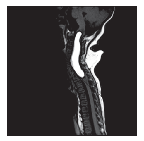
Figure A : Pre-contrast sagittal T1W image demonstrating a homogenous well-defined hyperintense spinal cord mass.

Intramedullary spinal cord lipomas not associated with dysraphism is frequently