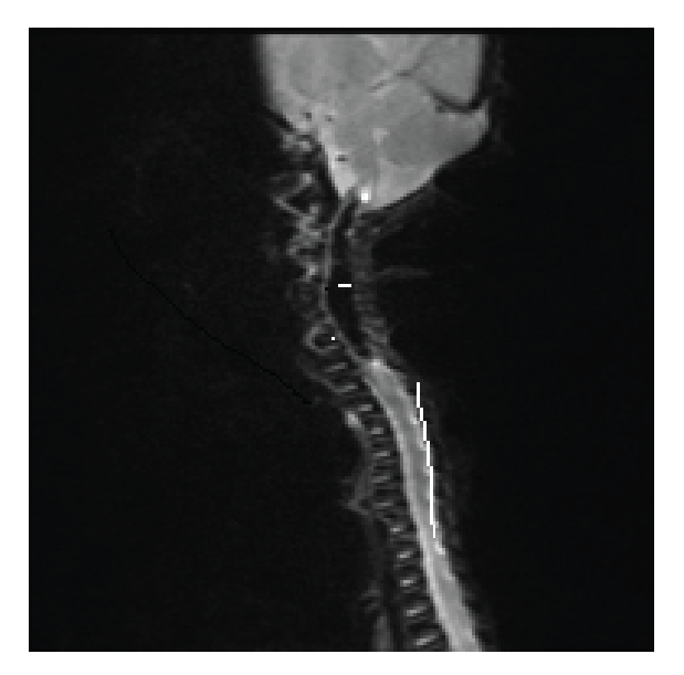
Figure C: The signal intensity dropped with fat saturation technique.