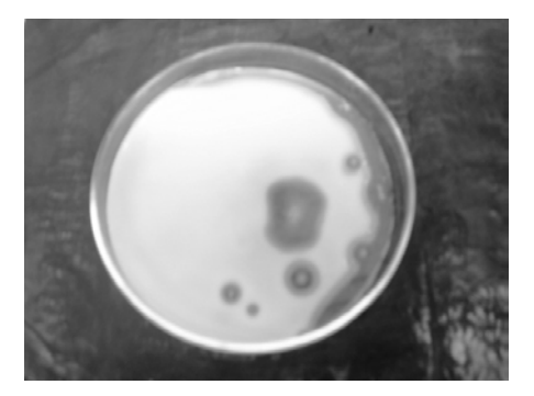
Fig. 1. Clear zone forming colonies at 10^{-4} fold diluted soil sample.

colonies were sub-cultured for the purification of the isolates (Figure 1). By visual observation, bigger clear zone forming eight isolates were selected. Clear zones were formed because of the hydrolysis of casein by protease produced from the isolates. Since the fat content of the whole milk inhibits the growth of bacteria, skim milk was used throughout the present study. Vidyasagar et al. [15] have used skimmed milk for the production haloalkaline proteases from Halogeometricum sp TSS101. Repeated subculture were performed up to uniform colonies were found. Finally, the eight (8) isolates were stocked in nutrient agar slant and stored at 4°C for further work. Such type of method was used by Srinivasan et al. [16] for the isolation of thermostable protease producing bacteria from tannery effluent.