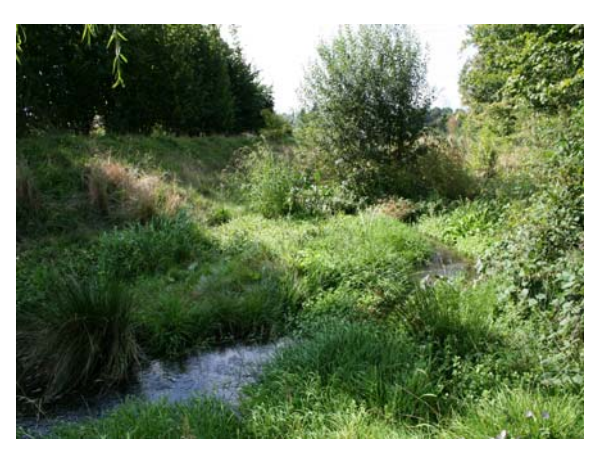
Fig. 3. Pulheim creek east of Geyen (Bachaue) after rehabilitation in summer 2009