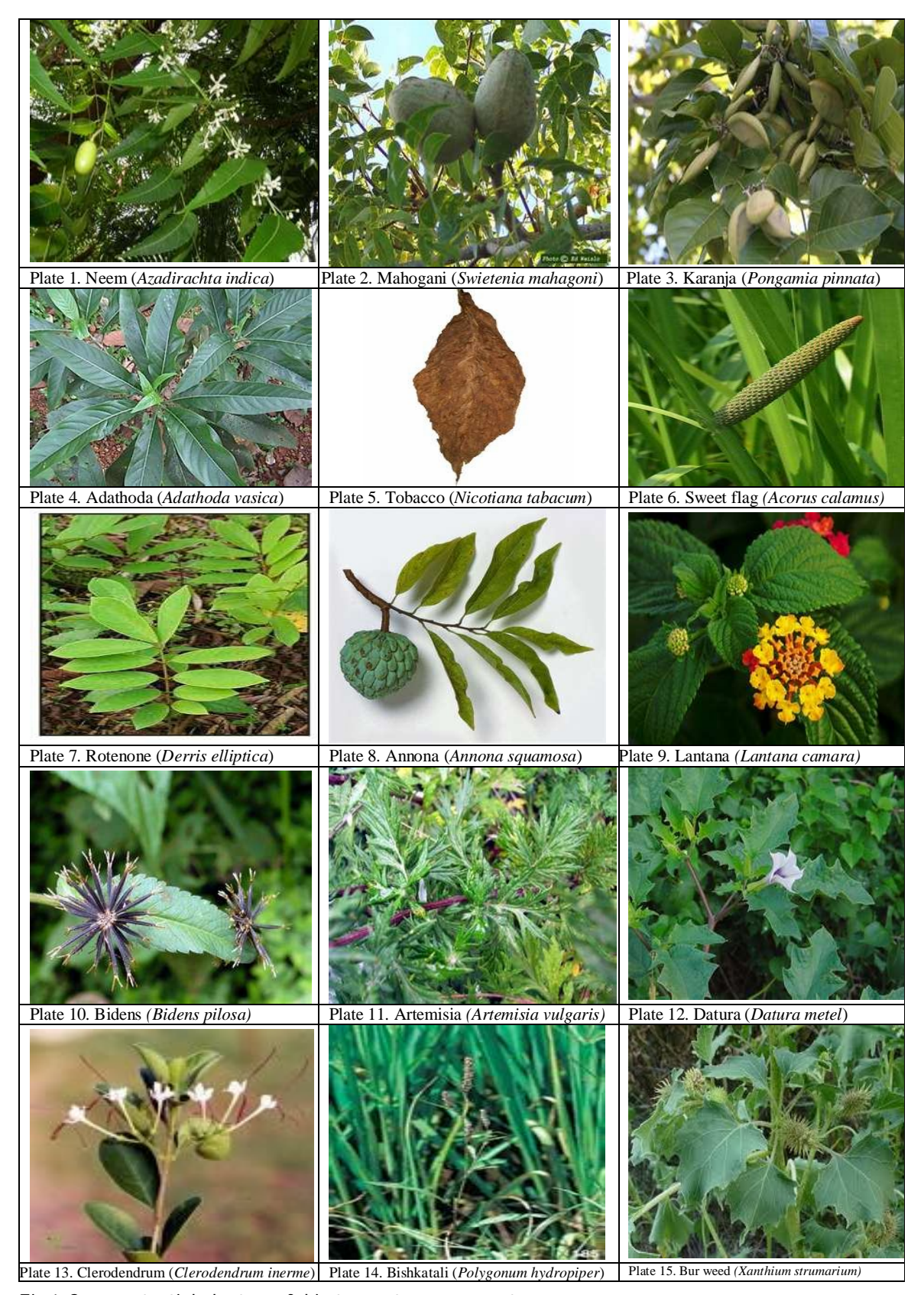
Fig.1. Some potential plants useful in tea pest management