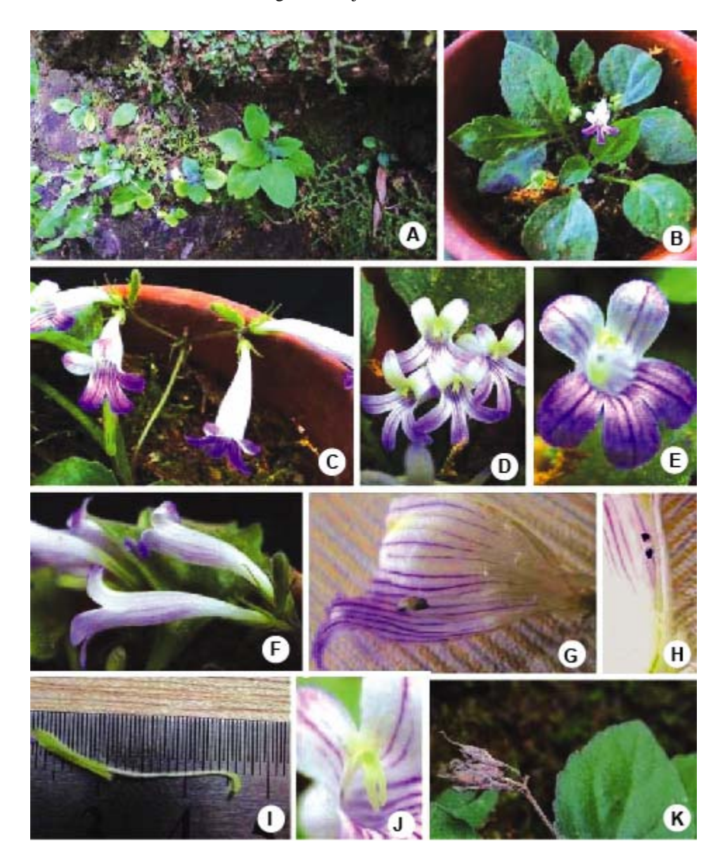
Fig. 2 A-K. Primulina lechangensis X. Hong, F. Wen & S.B. Zhou, sp. nov. A. Habitat; B. Plant with flowers; C. Cyme; D. Frontal view of cyme; E. Frontal view of a flower; F. Lateral view of flower; G. Opened corolla; H. Anthers; I. Pistil; J. Stigma; K. Capsule.

Etymology: The species is named after the type locality Lechang in Guangdong Province. Vernacular name: China: Lechang baochunjutai.