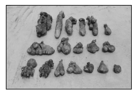
Fig. 2. Aerial tuber diversity in 2004-06 Upper row – BD-7866 (3 branch), BD-7847, BD-7872, BD-7857, BD-7847, BD-7852 (Left to Right)- ( Total-6) 1<sup>st</sup> middle row - BD-7850, BD-7882, BD-7851, BD-7859, BD-7868 (Total-5) 2<sup>nd</sup> middle row - BD-7861, BD-7849, BD-7897, BD-7883, BD-7877, BD-7865 (Total-6) Lower low- BD-7891, BD-7898, BD-7841,

Lower low- BD-7866, BD-7864, BD-7870, BD-7841 and BD-7874, Total-5)