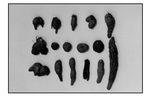
Fig. 1. Aerial tuber diversity in 1998-01

triple super phosphate and 120 g murate of potash were used in each pit as basal doses. Sufficient loamy soil was added in the pit. The experiment was laid out in a non replicated design. The plants were grown on bamboo trail. All intercultural operations were followed to have a good crop. The aerial and under ground tubers were collected in the month of March 2001, 2004, and 2006 from the first, second, and third experiment, respectively. Different observations were recorded as per Descriptors for Yam (IPGRI, 1997). Chi-square ( \chi^2 ) test was done for each qualitative character. Phenotypic diversity for qualitative traits are determined by using Shannon-Weaver Diversity Index (H'). H' ranges from 0 to 1, where 1 indicates the maximum diversity (Yu Li et al. , 1996). H' is defined as: H'= \Sigma PiLOg<sub>2</sub>Pi, where Pi is the proportion of the total number of germplasm accessions belonging to ith class. H' (SWDI) classified as low (H'<0.50), medium or intermediate (H'=0.50-0.75) and high (H'≥0.75) based on Jamago (2000). Range, mean, standard deviation and coefficient of variation for different quantitative characters are calculated.