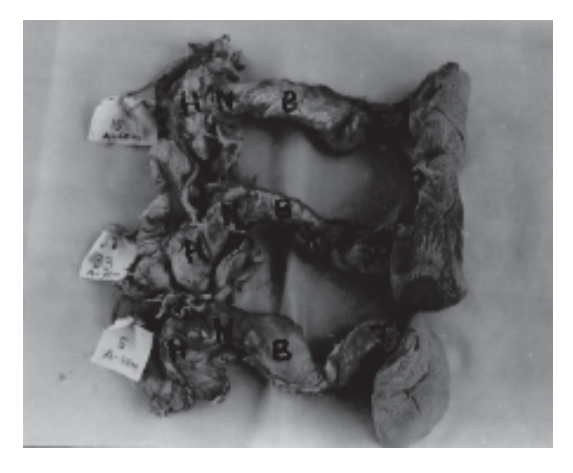
Fig.-1: Showing the morphology of pancreas. ( H = Head, N = Neck, B = Body, T = Tail )

Before measuring the weight of the pancreas, it was detached from the duodenum and the spleen and it was dried by blotting paper and weighed by an analytical balance.