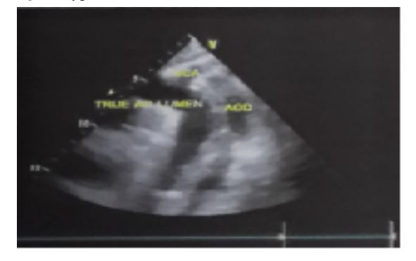
Fig-2: Echocardiogram showing suspected aortic dissection from origin of subclavian artery.